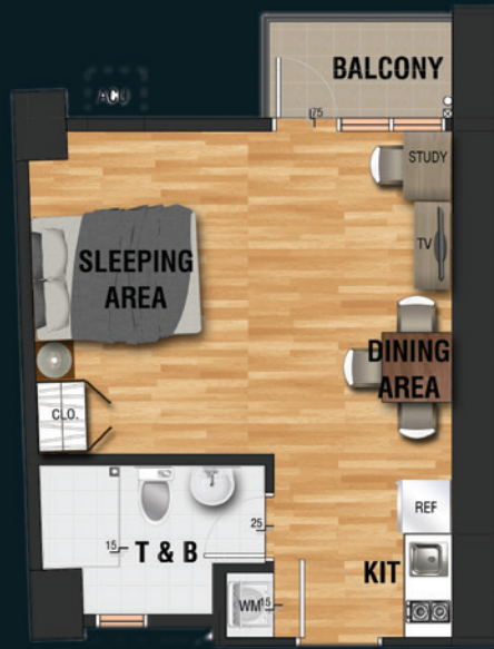
Studio A Floor Plan (28.58-29.72 sq. m. +2.40-5.70 sq. m.)