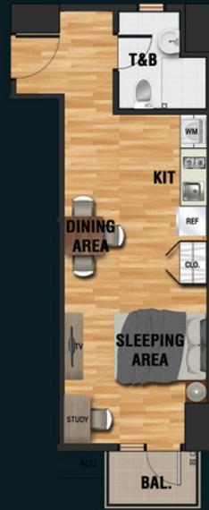
Studio E Floor Plan (30.47-30.91 sq. m. +2.40-4.95 sq. m.)