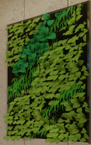
Lobby Lounge, Artist's Rendering