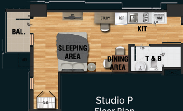
Studio P Floor Plan (22.13 sq. m. +2.49-3.51 sq. m.)