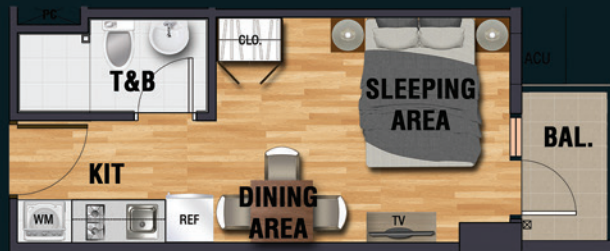
Typical Studio Floor Plan (19.58 sq. m. +2.40-9.60 sq. m.)