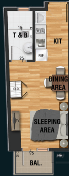
Studio B Floor Plan (25.55-22.87 sq. m. + 2.40 - 4.59 sq. m.)